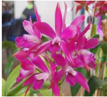
Ctt. Towering Inferno