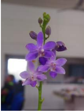
Summer Rose 'Jongs'