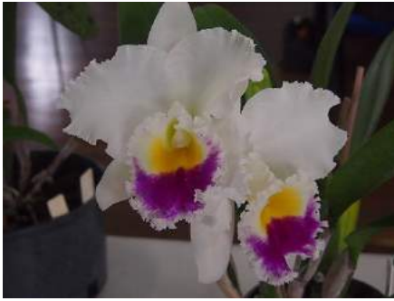
Dal's Pashion 'Rothwell'