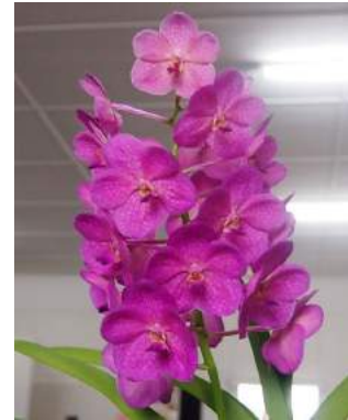
V. Boonyarit Delight x Ascda Yip Sum Wah